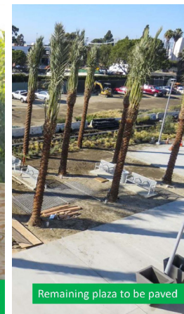
Remaining plaza to be paved