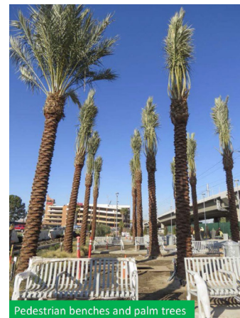
Pedestrian benches and palm trees