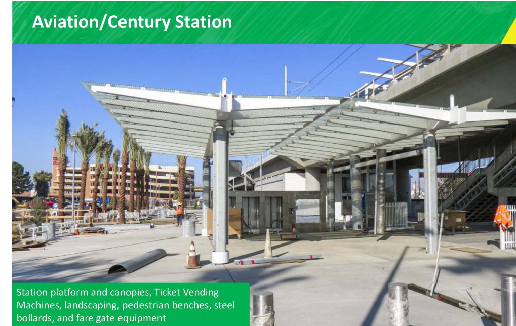
Station platform and canopies, Ticket Vending Machines, landscaping, pedestrian benches, steel bollards, and fare gate equipment