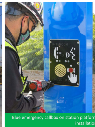
Blue emergency callbox on station platform installation