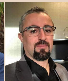
Kenan Tekin Hyatt Place / Hyatt House LAX