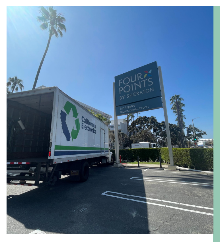
E-WASTE ROUND-UP TAKE 2

Due to the popularity of our first e-waste event, Gateway LA will host our second round-up on June 20, from 10 am to 1 pm at the Four Points by Sheraton LAX). We will partner with California Recycling for a 3-hour round-up where our members and stakeholders are invited to bring old televisions, computers, microwaves, freezers, and more. No batteries will be accepted at this event.